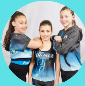
JUNIORS AGE 9 YRS - 12 YRS

CLASSES GRADE 4 BALLET (AGES 10-12YRS) PERFORMANCE GROUP PRIVATE LESSONS