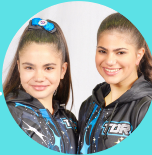
Seniors Ages 16+

CLASSES INTERMEDIATE BALLET & POINTE (AGES 15, 16 & 17) PERFORMANCE GROUP PRIVATE LESSONS