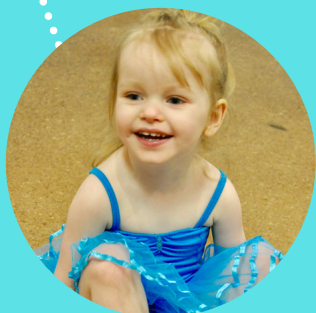
MINI'S AGE 2.5 YRS - 5YRS (PRESCHOOL)

CLASSES JAZZ/TAP JAZZ/BALLET JAZZ CONTEMPORARY MUSICAL THEATRE BALLET ACROBATICS HIP HOP