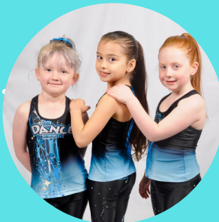
PETITES AGE 5 YRS - 8YRS (AT SCHOOL)

CLASSES BALLET BEGINNINGS (AGES 5-6YRS) PRIMARY BALLET (AGES 7-9) PERFORMANCE GROUP PRIVATE LESSONS