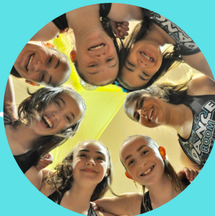
TEENS AGE 13-15

CLASSES GRADE 6 BALLET & POINTE (AGES 13 - 15) PERFORMANCE GROUP PRIVATE LESSONS